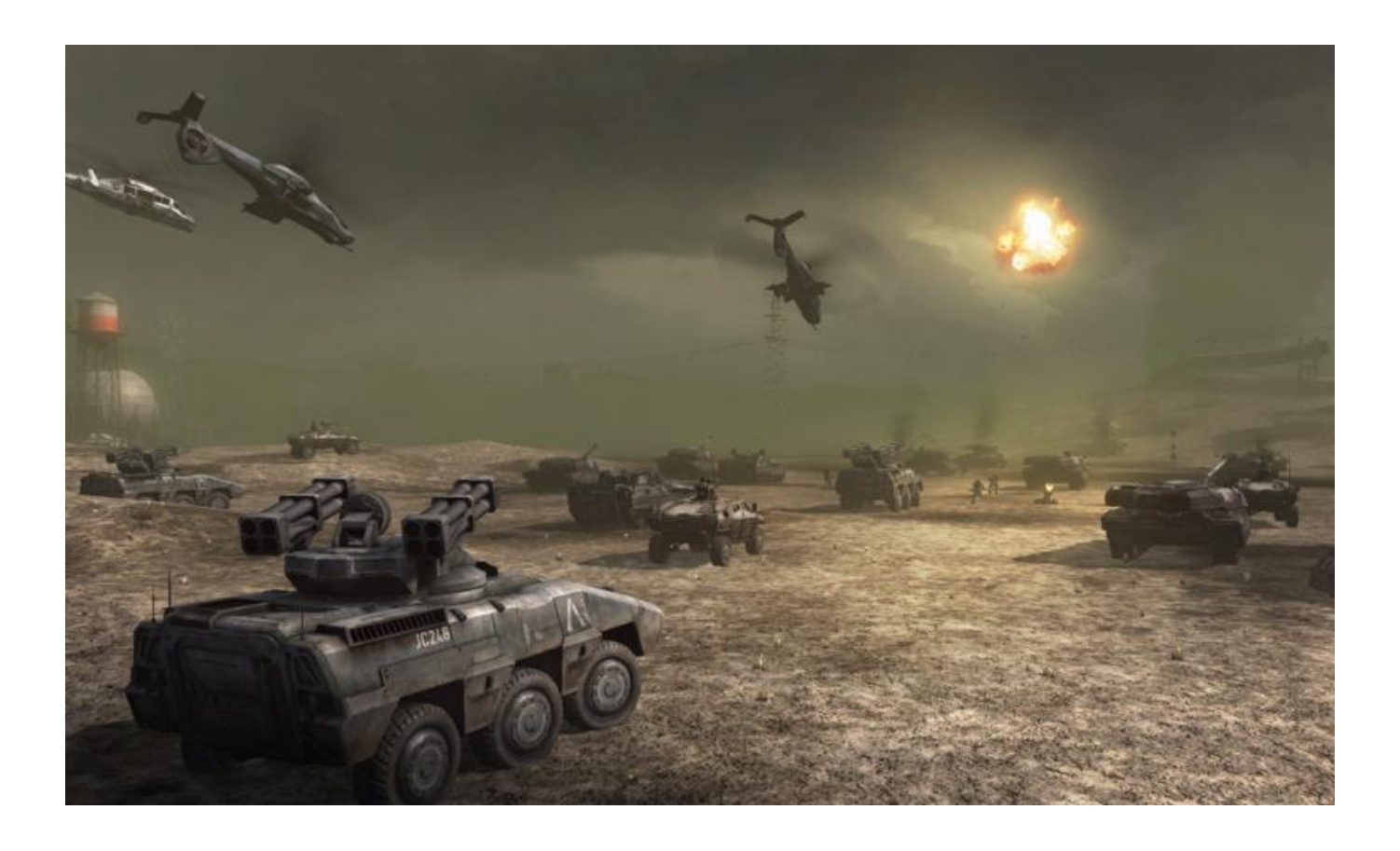
Download ->->-> <a href="http://bit.ly/2SMtB0X">http://bit.ly/2SMtB0X</a>

Cuban Missile Crisis: Ice Crusade Download For Pc [PC]